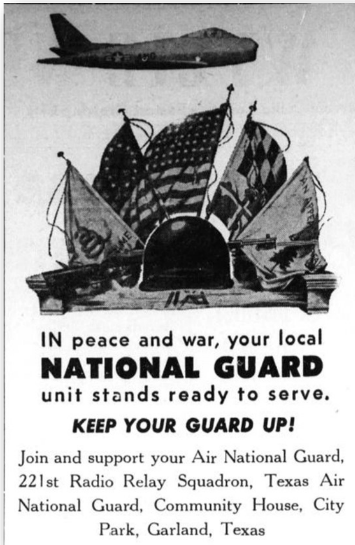
The Wylie News, February 16, 1956

In 1968, the 221st Radio Relay Squadron was rebranded as the 221st Mobile Communications Squadron and assigned to the 254th Mobile Communications Group. Later, its name was changed to 221st Combat Communications Squadron under the 254th Combat Communications Group. In 2009 it was announced that the 221st Combat Communications Squadron would be relocated to Hensley Field in Dallas. This