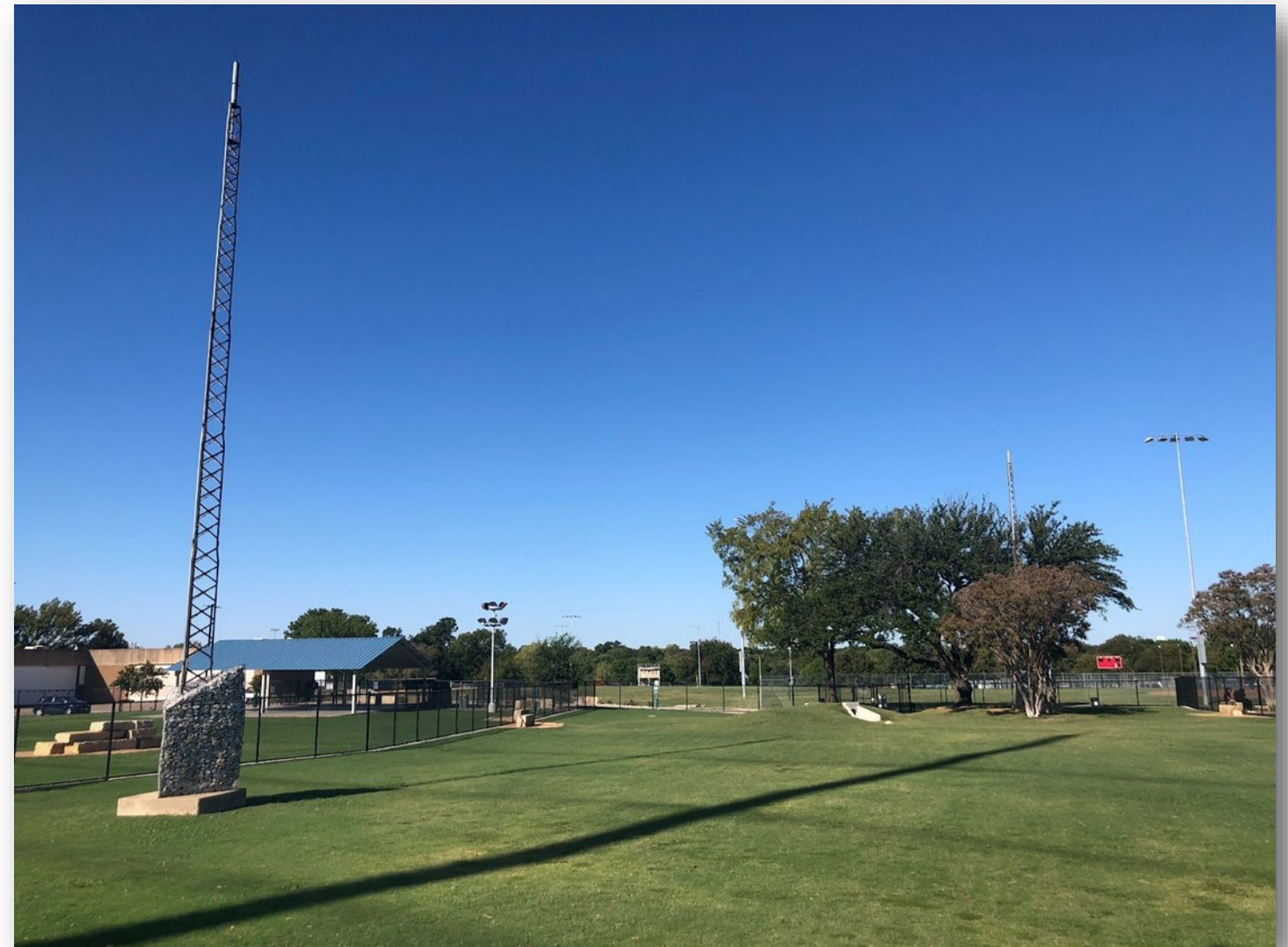
221st Radio Relay Squadron Antenna in the Dog Park Paddock, September 24, 2022.