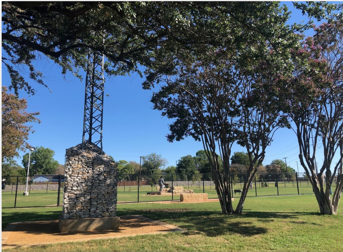
221st Radio Relay Squadron Antenna in the Dog Park area, September 24, 2022.