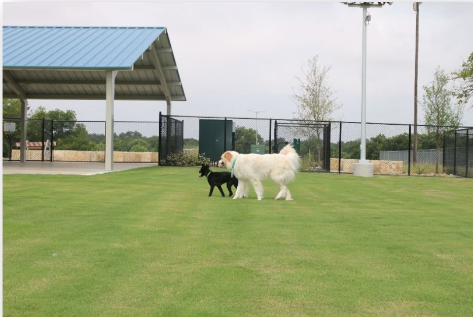
Garland Dog Park in 2020.