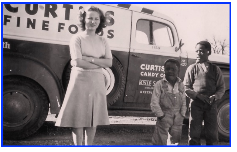
Garland Landmark Society

No sugar could be legally acquired by individuals without the stamps, which eventually applied also to items such as butter, clothing, coffee, gasoline, meat, shoes and more. Some candy manufacturing continued, and American soldiers' rations included special Hershey bars, often formulated