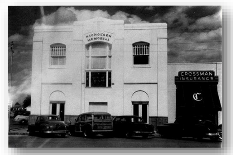
This image, ca. ***, shows the now demolished east side of the square with Nicholson Memorial Hall (formerly Citizens National Bank) and Crossman Insurance.